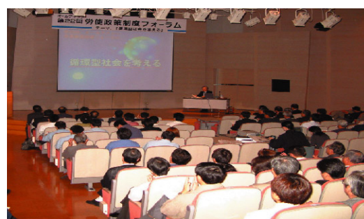
All-Aisin workers and employers policy system forum

Also, the All-Aisin Labor/ Management Policies and Programs Forum provided a venue for lectures by invited workers from outside the company, as well as panel discussions by the heads of environmental sections from neighboring municipal governments on the topic of a recycling-oriented society. At the forum, government officials, companies, and private citizens debated actions for the future.