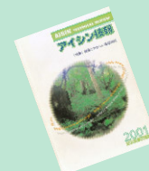
Aisin Technical Report