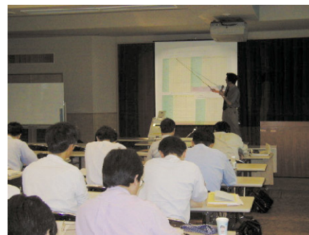
New section manager training

Our training materials are updated every year, due to the regular update and strict requirements of legal regulations in regard to the environment, and include training in the Waste Disposal Law and the Law Concerning Special Measures Against PCBs (polychlorinated biphenyls). This ensures that we are always educating our employees in the most up-to-date information possible.