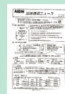
Global Environment News