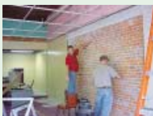
Repair work on a nursing home in a local community

Many employees in our overseas affiliated companies volunteer in many ways.