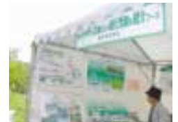
The 15th Aichi Urban Planting Fair