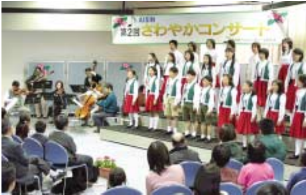
Aisin Sawayaka Concert

Aisin Seiki, aiming at being a corporation friendly to people, society, and nature, develops volunteer work in local communities so that every employee can exercise social responsibility as a "good corporate citizen" under the motto, "Be With." We are going to extend our activities for harmonious coexistence from the communities to the world in various fields including volunteer work.