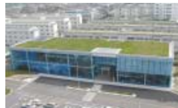
Rooftop of Aisin Com-center

In October 2003, we received the "President's Award of the Organization for Landscape and Urban Greenery Technology Development" from the Organization for Landscape and Urban Greenery Technology Development.