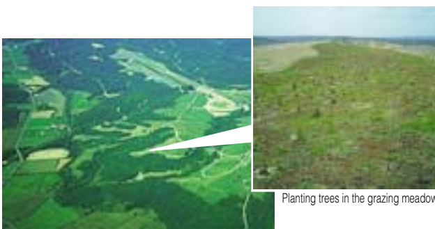
Toyokoro Proving Ground

Aisin Seiki has a test course for in-vehicle tests of automotive parts in Toyokoro Town in Hokkaido. When we built this test course, as a result of discussions with the local community, we reached an agreement about planting trees to make the grazing meadow around the test course a natural forest. This activity started in FY 2002 with a five-year plan.