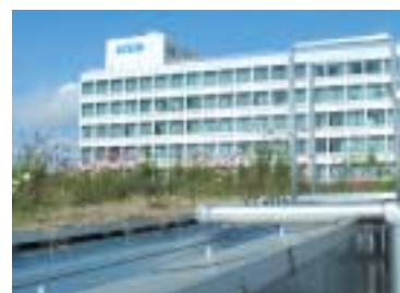
Rainwater utilization system on the rooftop of the Aisin Com-center