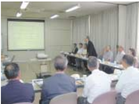
Meeting with people nearby

Every office and factory of Aisin Seiki has held a meeting with representatives of people nearby and governmental agencies every year in order to let them know about the status of our environmental conservation since FY 2002.